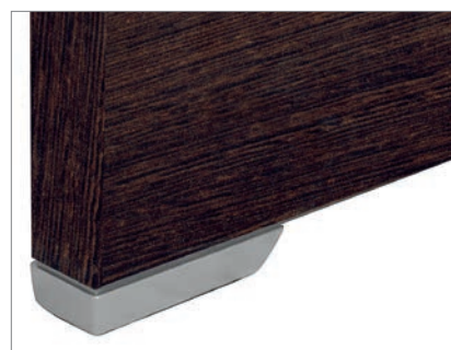
Anti humidity metal feet with antiskid pads